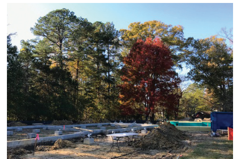
The footings are in place and construction of the new research lab is slated to be finished by April, 2021.

Longwood's Hull Springs has been awarded grant funding from the United States Department of Agriculture and GO VIRGINIA (Region 6) for a Commercial Kitchen Feasibility Study. The study will investigate the need for a commercial kitchen to be added to the dining facility designed to serve the Westmoreland County property, as well as the Northern Neck community. The scope of the study will include the operations, business model, examination of the use of integrated digital supply chain technology, and space plan with equipment specifications for a commercial kitchen, with canning/food preservation component, and culinary arts training offered through a partnership developed with Rappahannock Community College. Many of the small communities on the